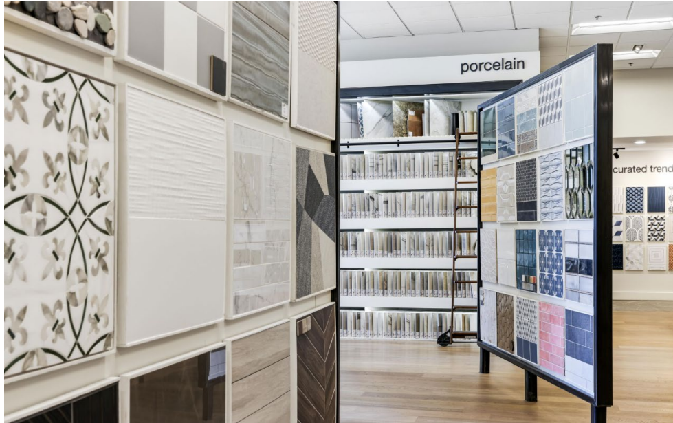
Showroom Floor — Tile Display